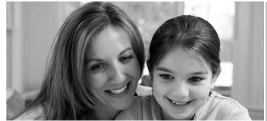
Someone like Amber wants a health insurance plan that provides her family a wider range of benefits. She may prefer the lower deductibles and lower out-of-pocket costs of Personal Select.