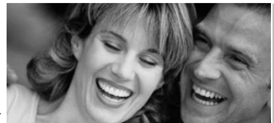
People like Mary and Carl like greater control of their medical expenses. They may prefer a plan with an SDA where the funds can be used to pay for select medical services. A good choice is Personal SDHP.